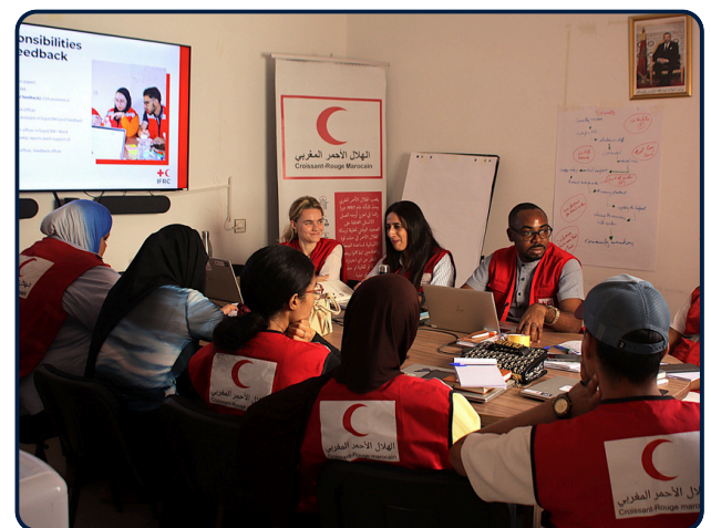
Training for Moroccan Red Crescent staff on how to use the community feedback management system, Taroudant, September 2025.

Management staff were trained to manage the system independently, including configuring new fields, creating reports, and troubleshooting issues. Sector focal points were briefed to follow up directly in EspoCRM, safeguarding accountability.