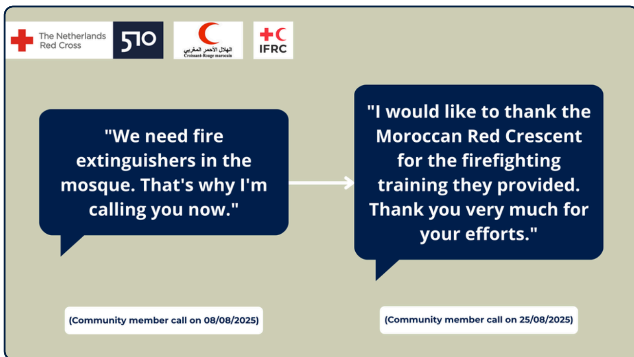
Figure 4: Impact statement from a hotline caller, 2025.

Community trust in the mechanism has grown noticeably over time. Callers have expressed appreciation for timely responses and follow-up calls, with 98% of callers indicating satisfaction with the response. The visibility of programmatic changes based on feedback reinforced the value of participation and encouraged more people to engage.