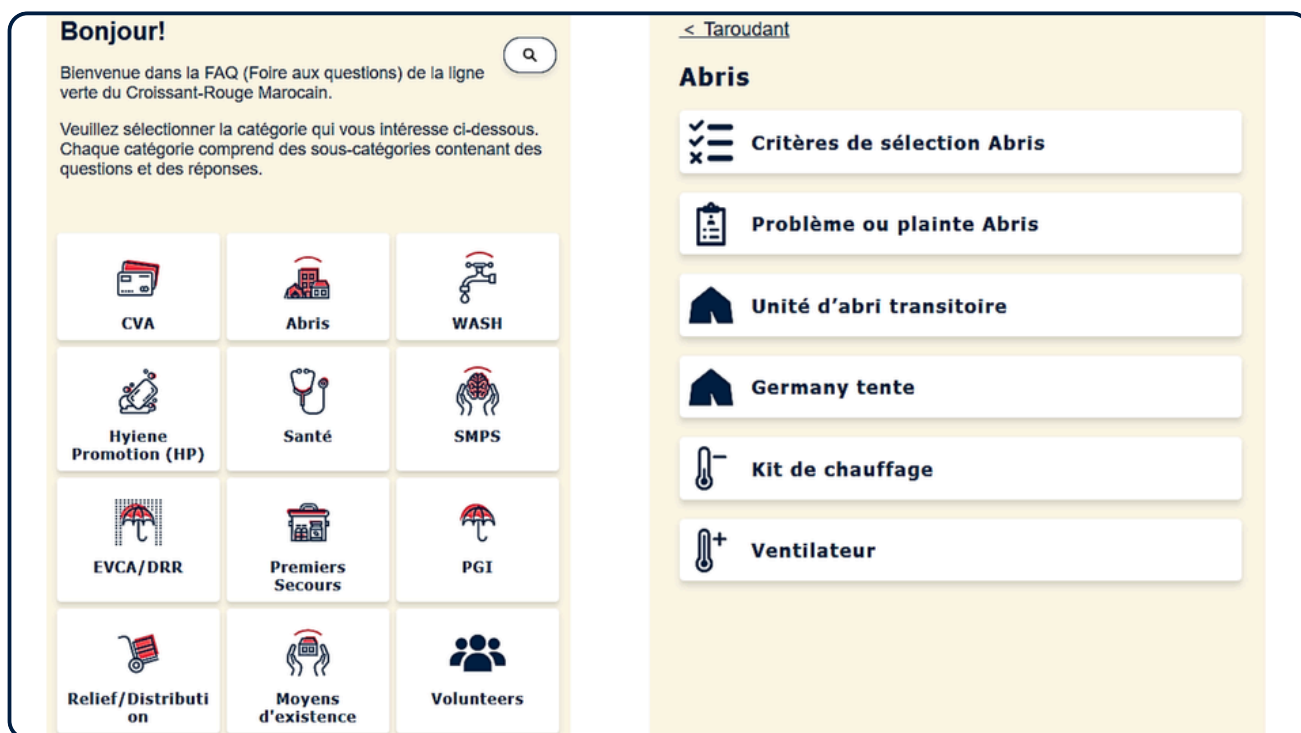
Figure 3: HIA interface for hotline operators, 2025.

To support hotline assistants, the Helpful Information web-App (HIA) was introduced, serving as a searchable FAQ database for hotline operators to quickly find answers to common questions. HIA is managed and updated as needed by the feedback officer, in collaboration with CEA assistants and sector teams.