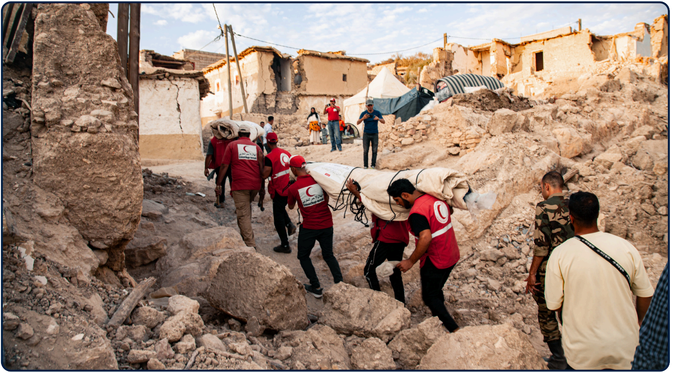
In response to the earthquake in Tamaloukt, the Moroccan Red Crescent, supported by the Qatar Red Crescent Society, distributes tents, mattresses, blankets and kitchen kits, September 2023.