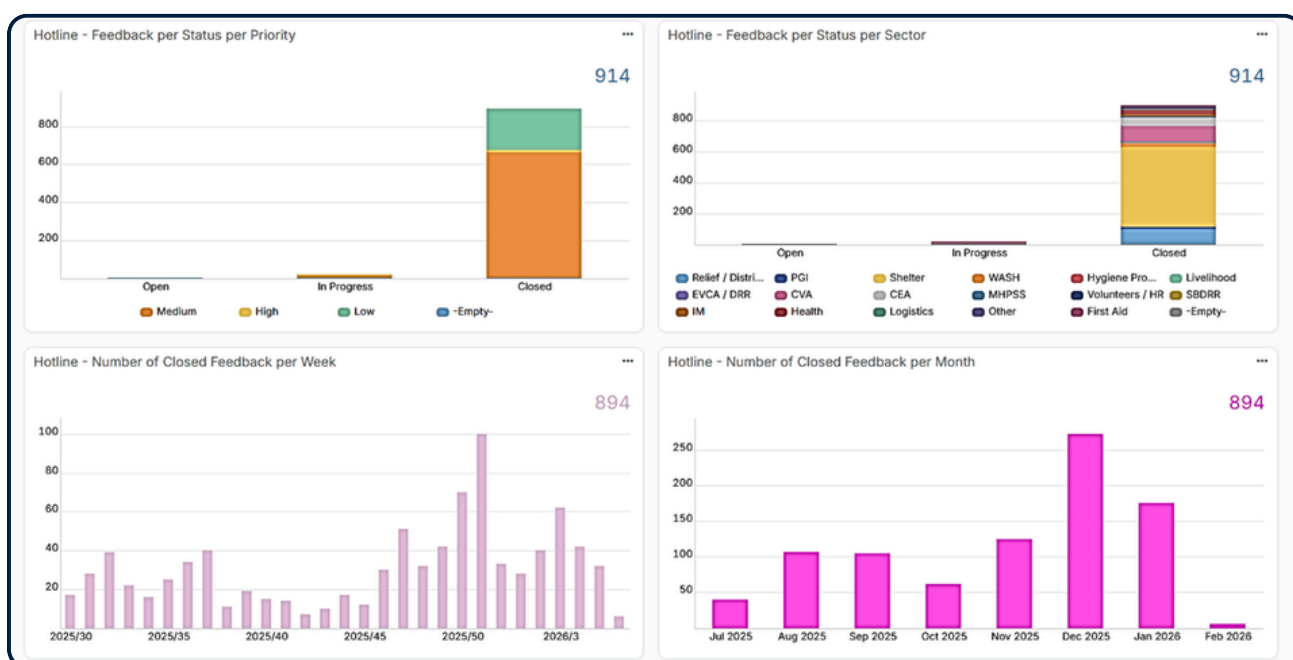
Figure 1: Dashboard of the Community Feedback Data Management System.

EspoCRM allows users to log feedback entries, assign cases to sector focal points in each branch, track status updates, and visualize data in real time. Each feedback entry includes key information such as date, location, channel, category, assigned sector, status, and resolution notes. The system automatically routes feedback to the appropriate sector and branch focal points who receive notifications and can update the status of each case directly in the system. Dashboards provide an overview of open, closed, and pending cases, enabling better coordination and faster decision-making.